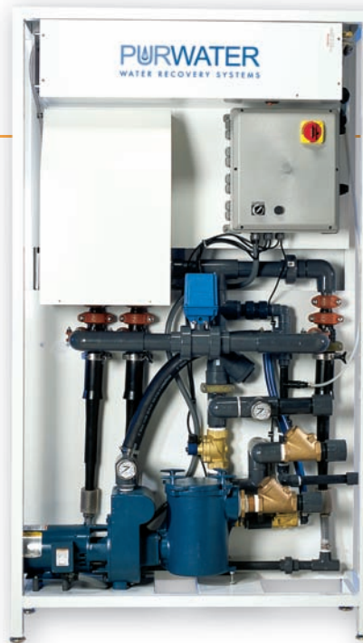
PurWater 2005 M120 Water Recovery System