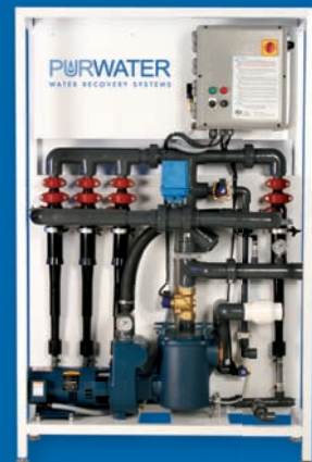
PurWater 3005 MAS Water Recovery System