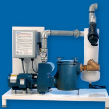
PurWater 100 FS5 Water Recovery System