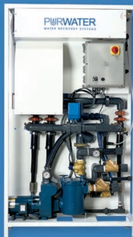
PurWater 2005 M120 Water Recovery System